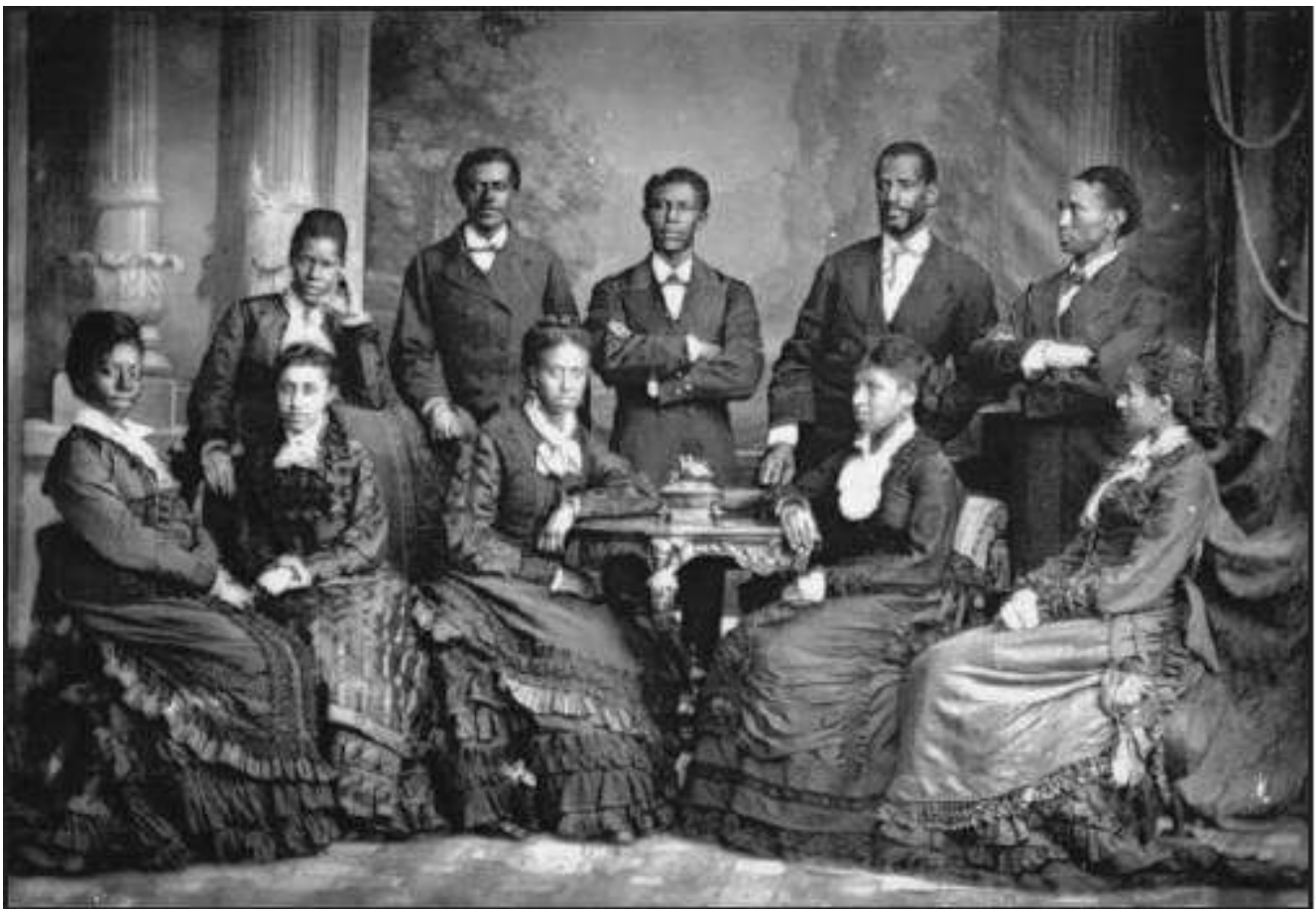
Fisk Jubilee Singers 1871